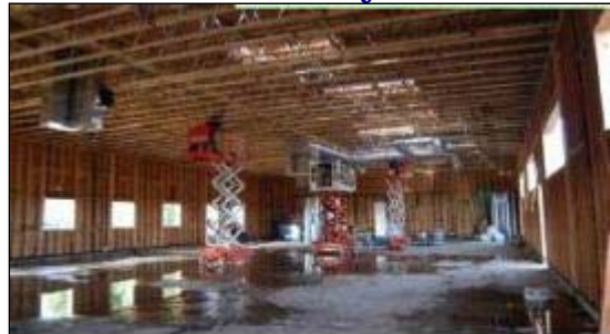
Construction on the Councilman Greig Smith LAPD Devonshire Area Youth Center in Northridge is well under way.

We broke ground on the PALS Center Thursday, June 5 with a community celebration. We were joined by Police Officers, residents, community groups, Board Members of Devonshire PALS, and many of the young people in the PALS and Police Explorers programs who will benefit from the center.